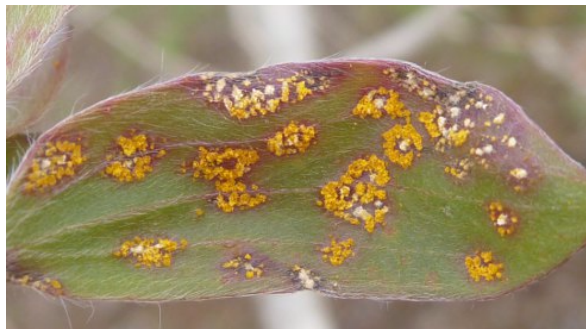
Leaf of broad-leaved paperbark on NSW's north coast infected with myrtle rust.

What happens when a plant pathogen invades a new continent brimming with potential victims? Australia is set to find out, as myrtle rust spreads within the country's dominant plant family – the Myrtaceae.