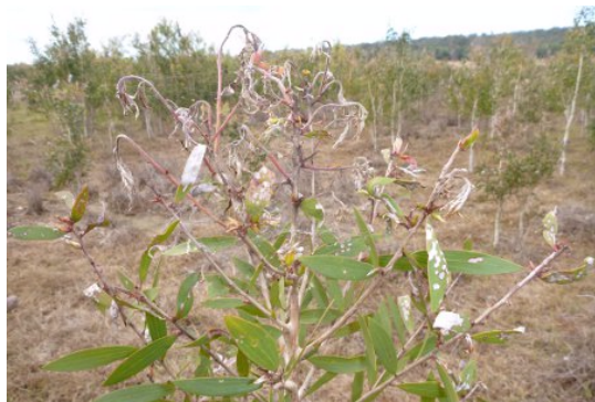
Regenerating broad-leaved paperbark on NSW’s north coast infected with myrtle rust, July 2011.

Of host species showing moderate to severe infection, some are rare (the endangered Rhodamnia angustifolia ), some are ecologically important (broad-leaved paperbarks, the nectar of which feeds lots of wildlife) and some are economically valuable (crops of aniseed myrtle and lemon myrtle).