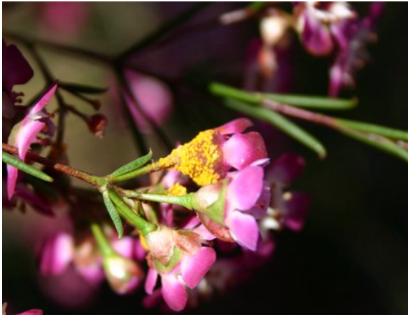
Flowers of Geraldton wax in Brisbane infected by myrtle rust. Geraldton wax is endemic to Western Australia but widely grown in gardens and for the cut flower trade.